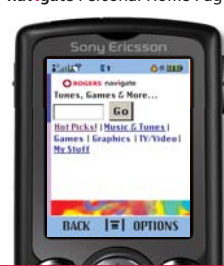
navigate Personal Home Page