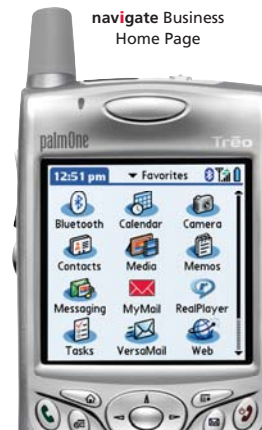
navigate Business Home Page

A standard data roaming rate of 5¢ per KB applies in both the United States and other countries and applies in addition to regular data usage rate. Customers with a MyMail E-mail plan will be billed 1¢ per KB while roaming in the U.S., Puerto Rico or the U.S. Virgin Islands.